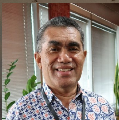
Speaker: Fransiskus Xaverius Teguh (Ministry of Tourism and Creative Economy)